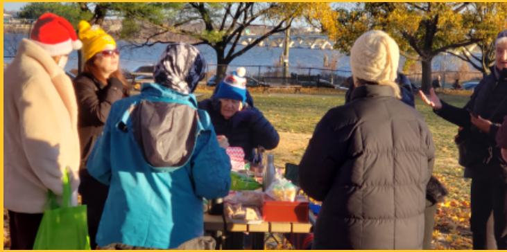
In the park