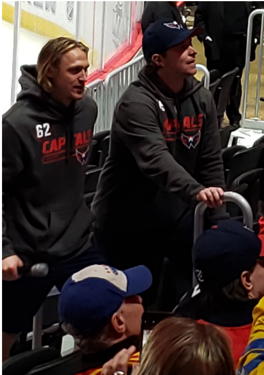
Swedish players Nicklas Bäckström and Carl Hagelin.