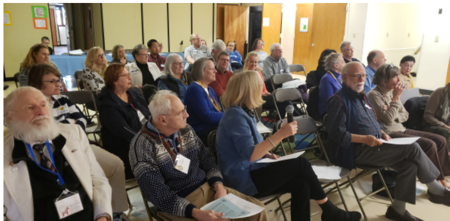
The audience had many follow up questions.